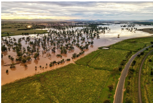
Top: The Tamworth Road. Centre: The Namoi in flood and Manilla School. Bottom: Gunnedah

The area has a long history of flooding which authorities seem unable to stop