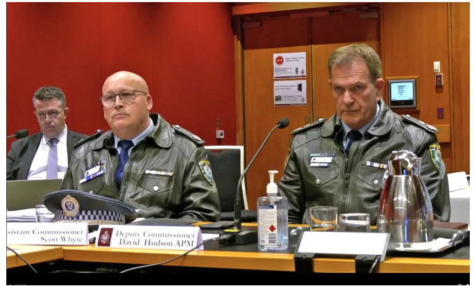
Senior Police answering question at a NSW Budget Estimates Committee Hearing

The NSW Firearms Registry is moving to new premises on the NSW Tweed Coast not far from its existing location at Murwillumbah.