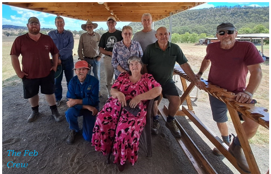
The Feb Crew