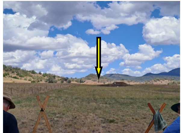
800 yard target

Lunch was next on the agenda, a chance to cool off and rehydrate before we moved down to the 800y marker.