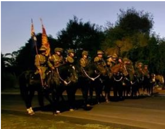
Dawn service at Bogan Gate Lest we forget

We always have a very special dawn service at Bogan Gate, this year we heard some service stories of locals who had enlisted and gone above and beyond. One local was in the last unit to leave Gallipoli. We also had 12 riders re-enacting the 6th Light Horse Trundle Troop.